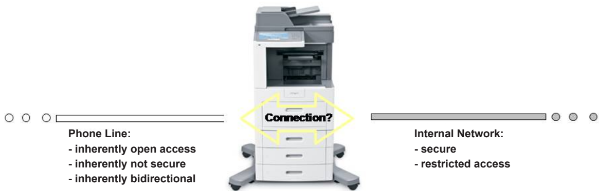
Figure 1.0 – The Proposed Exposure

Based on these two attributes, it has been proposed that a security exposure may be present. Couldn't someone connect to the MFP via the modem and then somehow get information off of the network, thus exposing the customer's network to inappropriate access?